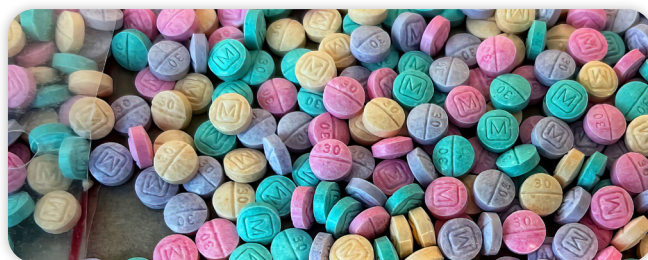
*FAKE rainbow oxycodone M30 tablets containing fentanyl